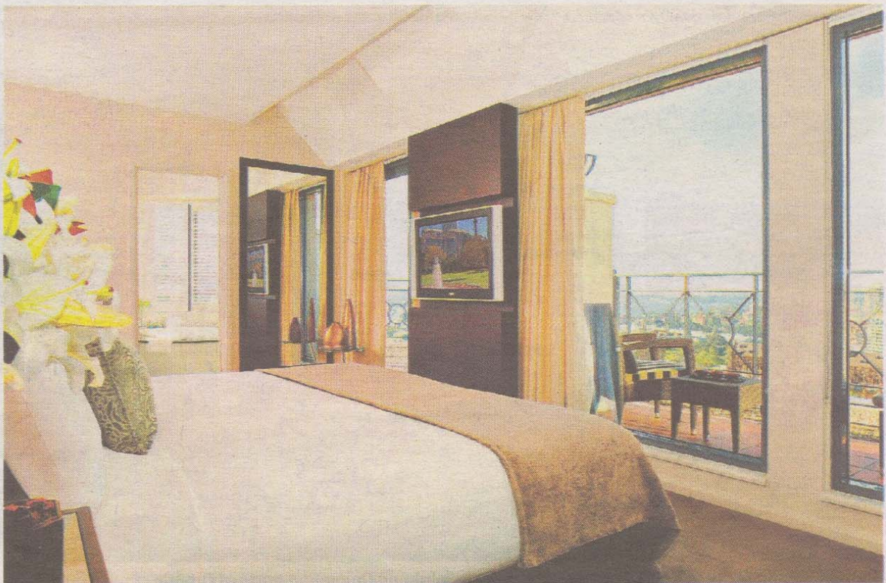
Plush: The lavishly decorated Royal Suite bedroom at Sheraton On The Park